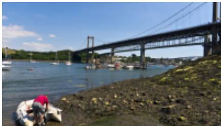
The Tamar River & Bridge

Our latest Ebay purchase, an Enterprise Class sailing dingy. located in Saltash, Cornwall. Glen, Lex and I travelled down on the Friday night and stayed at the Crooked Inn, just outside Saltash. The very best B&B that I have ever stayed in, happy to make sandwiches at 11.15pm when we arrived, with the obligatory couple of pints. Very pet friendly and excellent food, wish we could have stayed longer!